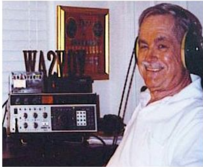
Russ, WA2VQV worked:

20 Meters SSB: HK3JJH/1 SA-040 Colombia, JX9JKA EU-022 Jan Mayen Island, T48RRC NA-218 Cuba.