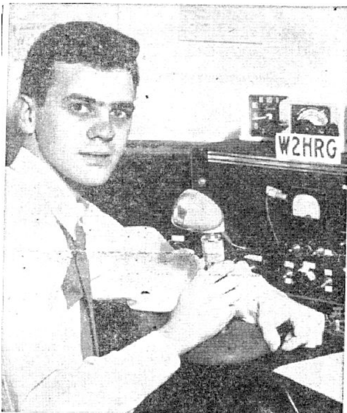
Radio amateur with home-brew 120W AM/CW transmitter (left) and matching communications receiver (right), around 1953.

Remember when hams made their own radios? I remember a QST article about a South American ham who even made his own tubes! Around 1957, I met a blind ham buying small parts, and putting them into envelopes which he had previously marked in Braille. He said he was building a field strength meter, with a voltage controlled audio oscillator instead of a panel meter. Yes, he did his own soldering!