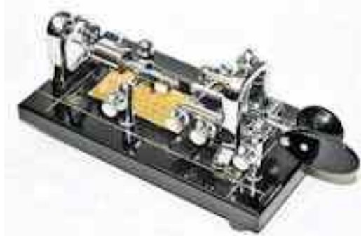
100th Anniversary Original Bug

The Koch method of teaching International Morse Code is the result of scientific experimental study to determine the fastest way to learn to copy 20wpm Morse code. (20 wpm in 30 days)