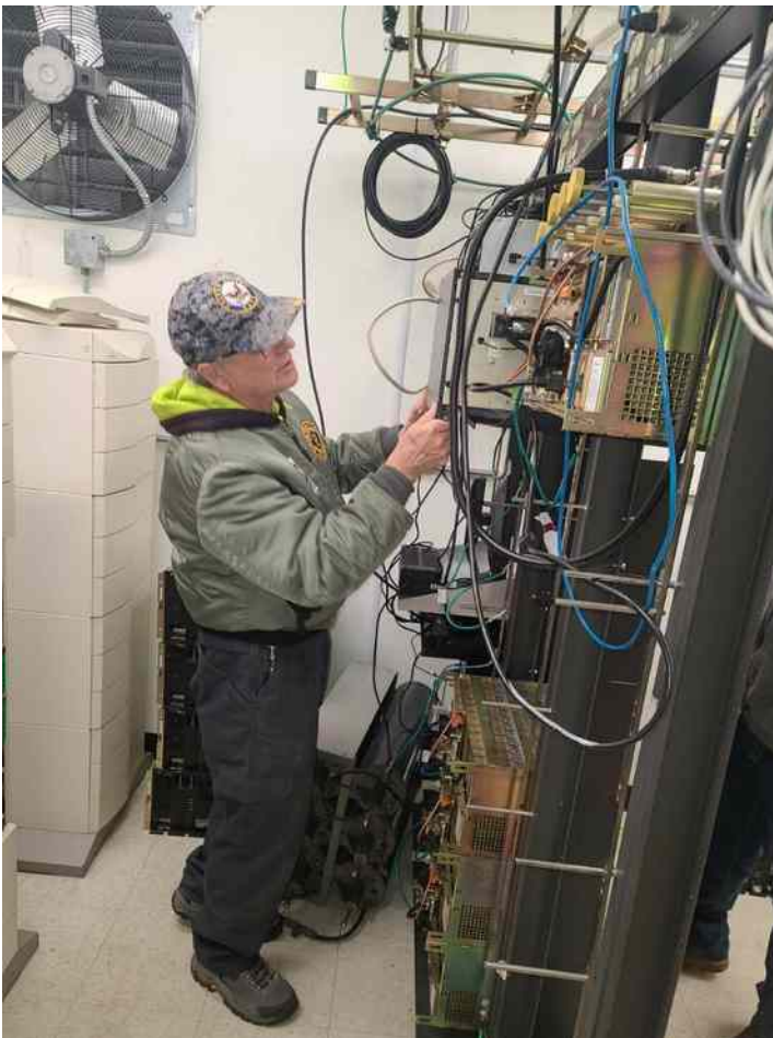
WX2NJ installing Chatsworth APRS Digipeater

The antenna on the Chatsworth tower is approximately 300 feet above sea level. The digipeater carries the ID CHATSW and is operated under callsign WA2RES with an output of 50 watts on 144.390 MHz.