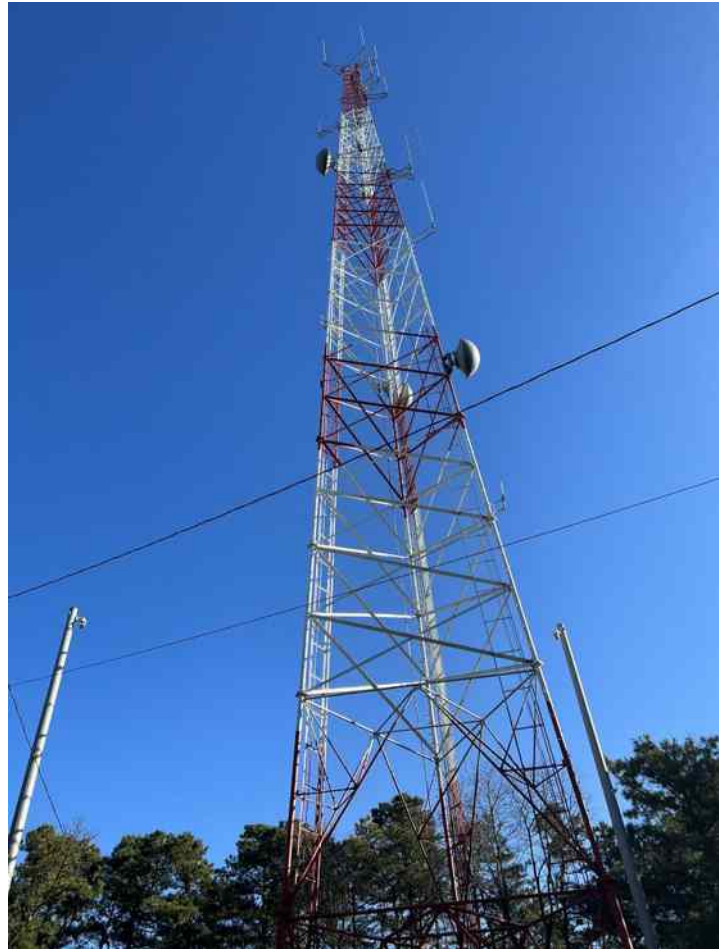
Chatsworth Tower

removal of the Barnegat APRS Digipeater and the Chatsworth unit will certainly improve coverage.