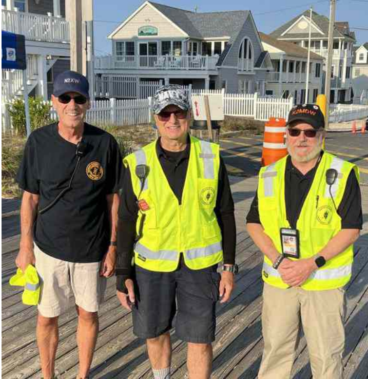
N2XW, WX2NJ, K2MDW

The weather was spectacular and there were approximately 150 walkers raising funds for Habitat. ARES provided communications support for the walk and ensured all walkers stayed on course and were safe. A special thanks to KD2FFR for acting as Habitat liaison and K2MDW who was net control.