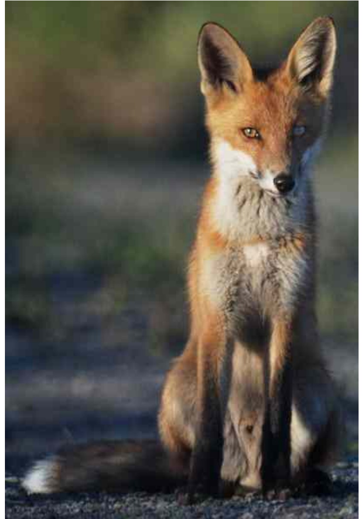
(Red Fox photo from Wikipedia)

When we arrived to where we thought the fox was located, the fox was not seen, so we headed back to the main road to take another reading. The reading this time indicated the fox may be straight ahead of where we were standing, so back into the cars and we headed in that direction.