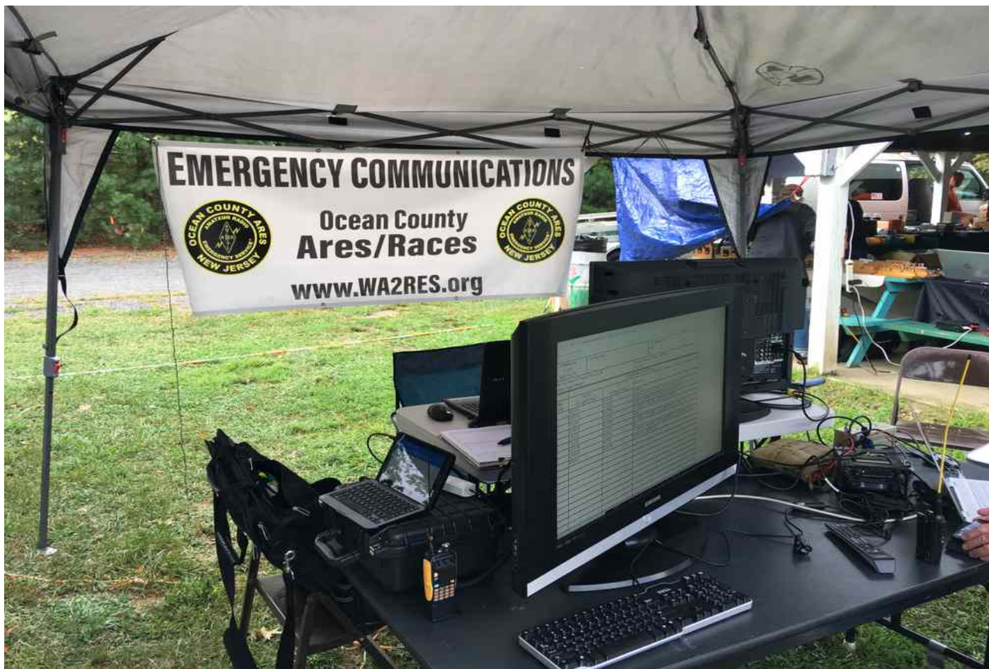
Ocean County ARES NBEMS demo at the Gloucester County Hamfest in 2019

used on a PC or AndFlmsg on an Android device. The MT63-2KL mode is normally used between 500 and 2500 Hertz. You can use a connection as simple as the acoustic coupling method of just holding your device mic up to your transceiver speaker to decode or holding your mic up to your device speaker to encode. The only Wednesday that the NBEMS net will not be conducted is the second Wednesday of the month when we have a Skywarn net at 8:00 PM. Until further notice, NBEMS training nets will be on the WA2RES/R in Toms River,