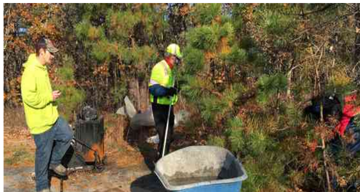
Second Search finds red shirt on tree branch. Waretown Police were dispatched to investigate

Unfortunately, the individual was not found and we are now entering the third week of him missing. Many clues were located and turned over to authorities after their positions were noted, photographed, and isolated