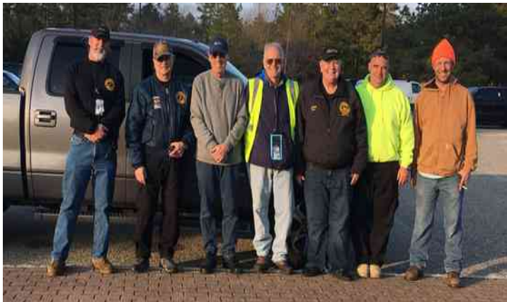
L to R: NJ2N, WX2NJ, N2XW, WB2ALJ, K3MR, KG2RUV, KD2DHS. 11/17/18 Search Team

The next meeting of Ocean County ARES will be December 19 th , 2018 at 7:00 PM at the Ocean County EOC, Robert J. Miller Airpark. This will also be the annual holiday party so bring your appetite and significant other. We will discuss and debrief the two days of search teams during the meeting.