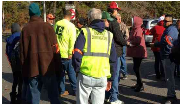
WB2BLJ Listens to Search Party Briefing